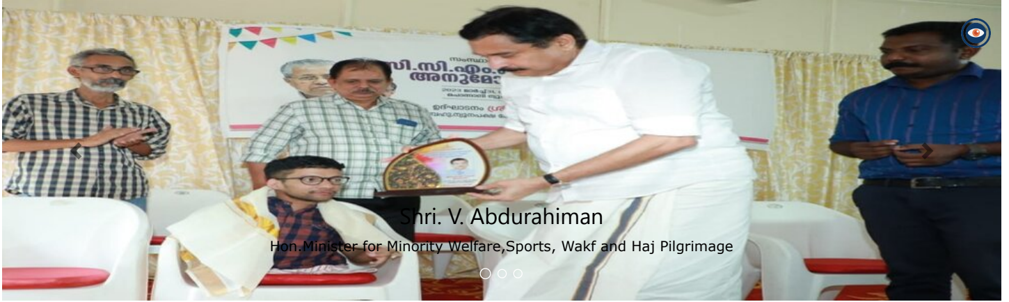
Shri. V. Abdurahiman

Hon. Minister for Minority Welfare, Sports, Wakf and Haj Pilgrimage