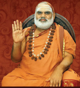
Sri.Sri. Bharathi Theertha Swamikal (Patron)