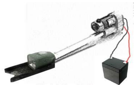
Model No: RR2