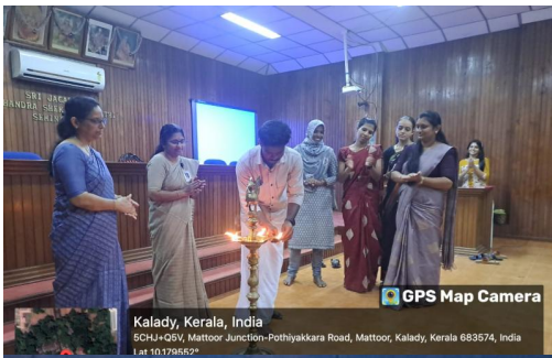
Kalady, Kerala, India 5CHJ+Q5V, Mattoor Junction-Pothiyakkara Road, Mattoor, Kalady, Kerala 683574, India Lat 10.179562°