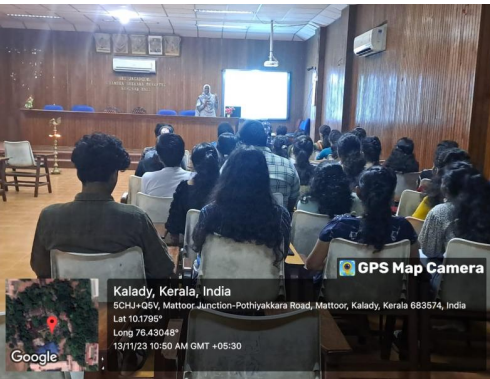
Kalady, Kerala, India 5CHJ+Q5V, Mattoor Junction-Pothiyakkara Road, Mattoor, Kalady, Kerala 683574, India Lat 10.1795° Long 76.43048° 13/11/23 10:50 AM GMT +05:30