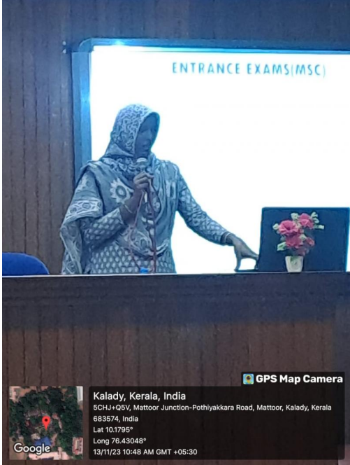
Kalady, Kerala, India 5CHJ+Q5V, Mattoor Junction-Pothiyakkara Road, Mattoor, Kalady, Kerala 683574, India Lat 10.1795° Long 76.43048° 13/11/23 10:48 AM GMT +05:30