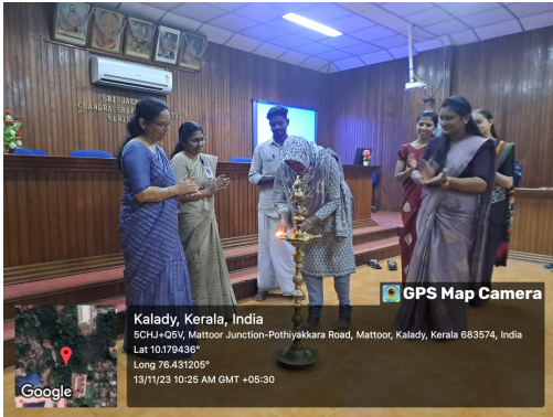
Kalady, Kerala, India 5CHJ+Q5V, Mattoor Junction-Pothiyakkara Road, Mattoor, Kalady, Kerala 683574, India Lat 10.179438° Long 76.431205° 13/11/23 10:28 AM GMT +05:30