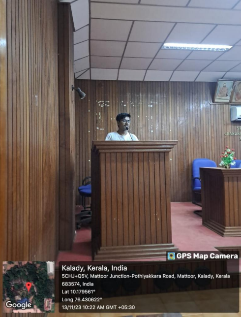
Kalady, Kerala, India 5CHJ+Q5V, Mattoor Junction-Pothiyakkara Road, Mattoor, Kalady, Kerala 683574, India Lat 10.179561° Long 76.430622° 13/11/23 10:22 AM GMT +05:30