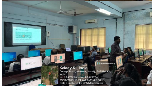
Kalady, KL, India College Road, Mattoor, Kalady, 683574, KL, India Lat: 10.179218, Long: 76.429774 09/16/2023 10:24 AM GMT+05:30 Note: Captured by GPS Map Camera