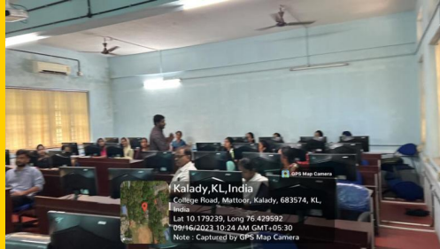
Kalady, KL, India College Road, Mattoor, Kalady, 683574, KL, India Lat: 10.179239, Long: 76.429992 09/16/2023 10:24 AM GMT+05:30 Note: Captured by GPS Map Camera

VENUE Computer Lab, SF17, Commerce block