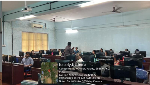
Kalady, KL, India College Road, Mattoor, Kalady, 683574, KL, India Lat: 10.179271, Long: 76.429672 09/16/2023 10:24 AM GMT+05:30 Note: Captured by GPS Map Camera